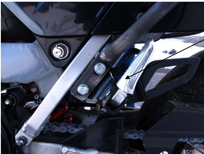
Left Passenger Peg Bracket